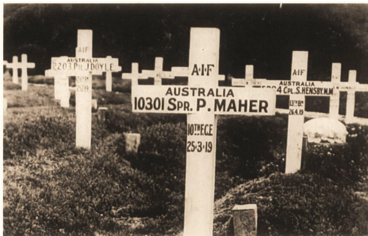
Original Cross Marker for Sapper P. Maher in Tidworth Military Cemetery, Wiltshire