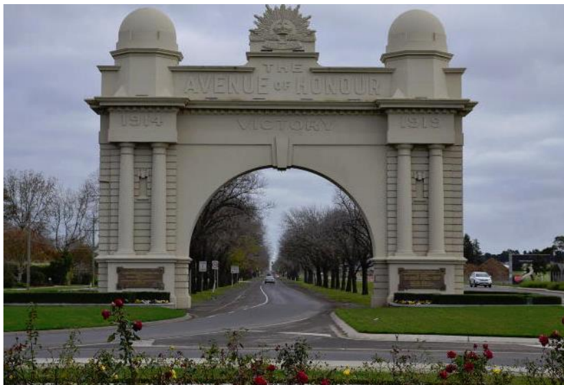
World War 1 Victory Arch at the entrance to Avenue of Honour Trees in Ballarat

The trees were named and numbered, as close as was possible at the time, in the order of enlistment from the Ballarat end, odd numbers on the south side and even numbers on the north. Only exotic deciduous species were used, mostly Elms, Oaks, Poplars and Ash. In 1934 the Bronze Memorial Plaques were added to the Avenue and located at the base of the trees. Each plaque contains a name, battalion and tree number.