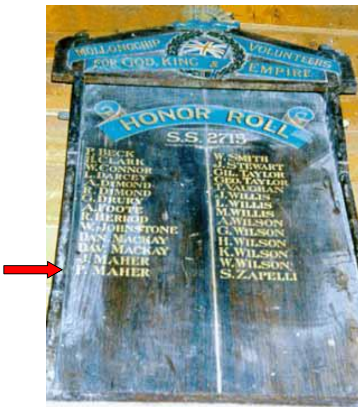
Mollonghip State School Honor Roll