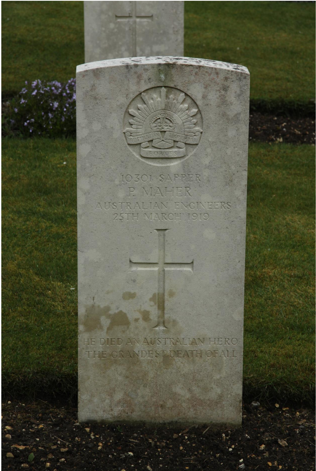
Photo of Sapper P. Maher's Commonwealth War Graves Commission Headstone at Tidworth Military Cemetery, Wiltshire.